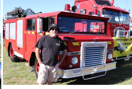
Plus....other members trucks