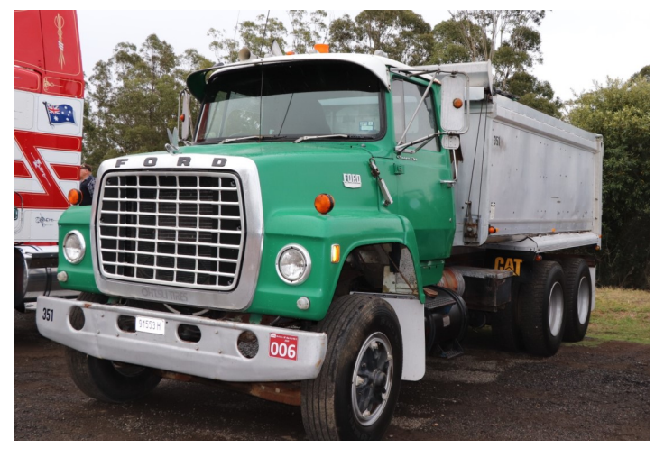
Two trucks, in our club, that participated in the blockade in April 1979.